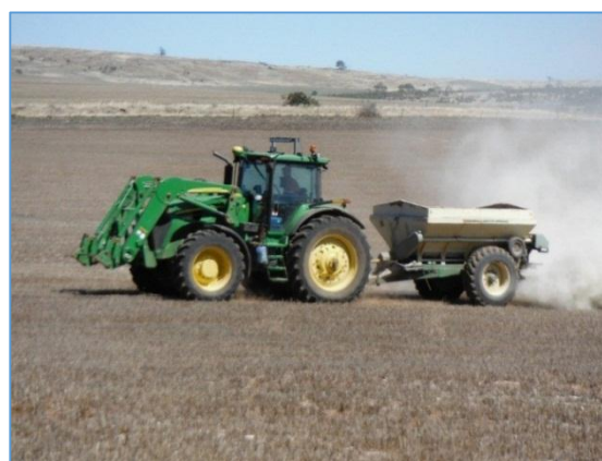
Figure 5: Applying lime according to the pH zones

Other case studies from Precision Agriculture (Victoria) have shown that the cost savings of applying the appropriate amount of lime for different areas of the paddock compared to applying a uniform rate to the whole paddock range from 20 - 60% with an average saving of 30%. In some cases more lime may be required in more highly acidic areas but the cost will be out-weighted by the improvement in productivity.