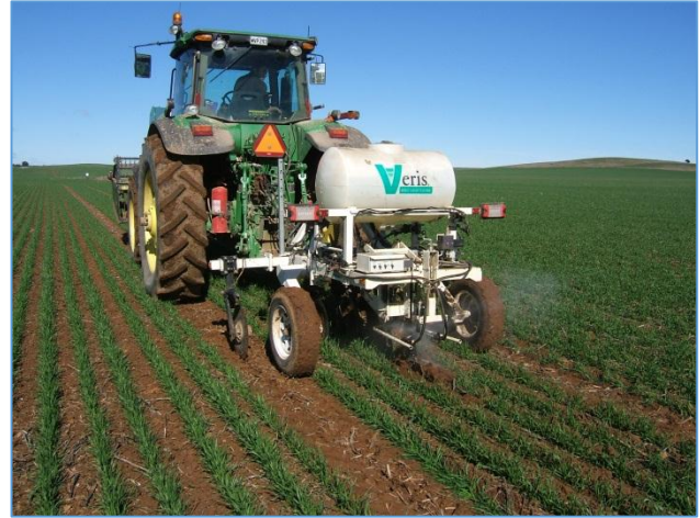
Figure 2: Veris pH Manager™

Due to an increased demand for the on-the-go soil pH mapping and to further develop this technology led Primary Industries and Regions SA (PIRSA) to invest in a Veris pH Manager™ machine in 2015. This machine is based at the Clare office and is available to undertake pH mapping work for projects or individual farmers on a cost-recovery basis.