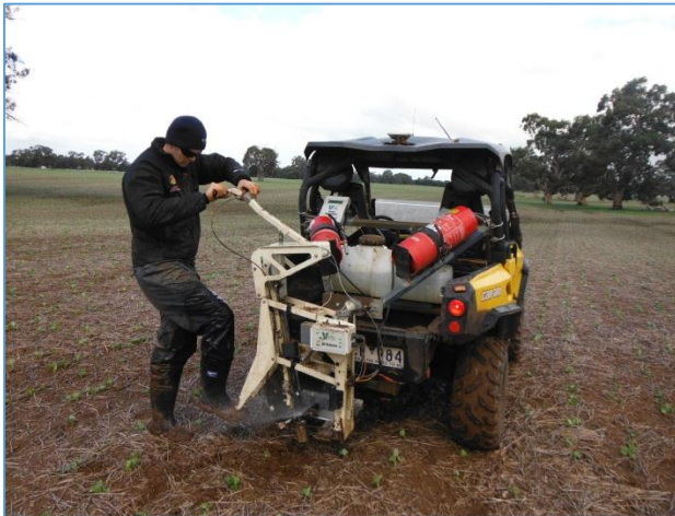
Figure 1: Veris pH detector

Calibration of the machines under controlled environmental conditions has shown that they are both highly correlated with laboratory pH (CaCl 2 ) values.