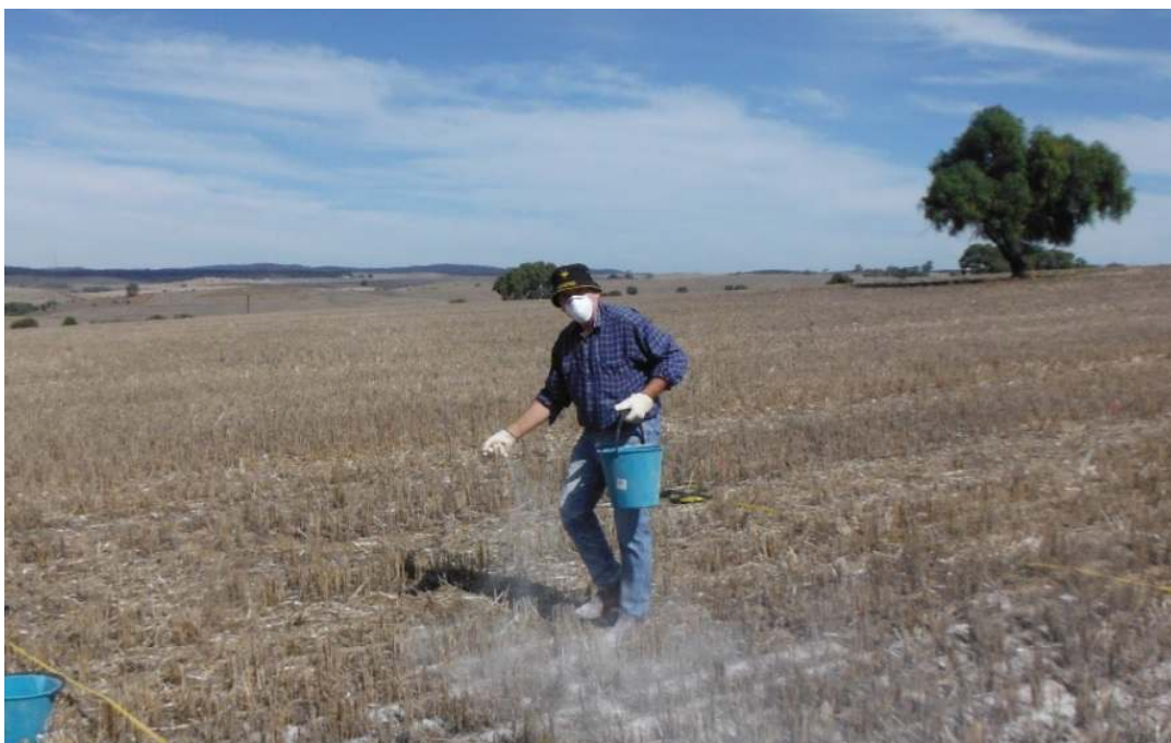
Figure 1: The lime was applied by hand on 22 April 2015

The products were applied by hand on the 22 April 2015. The site was sown by the farmer to wheat (Mace) on the 4 th May 2015 and will be sown to barley in 2016 and faba beans in 2017.